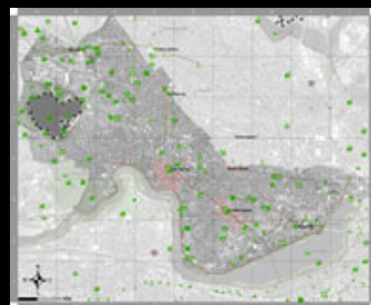
GreenMap MIT: mapping environmental resources around MIT and Cambridge