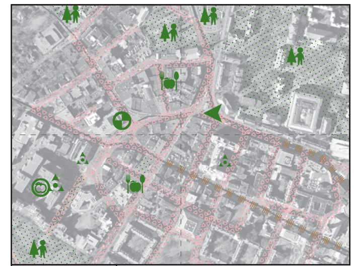
Harvard Square 3x Central Square