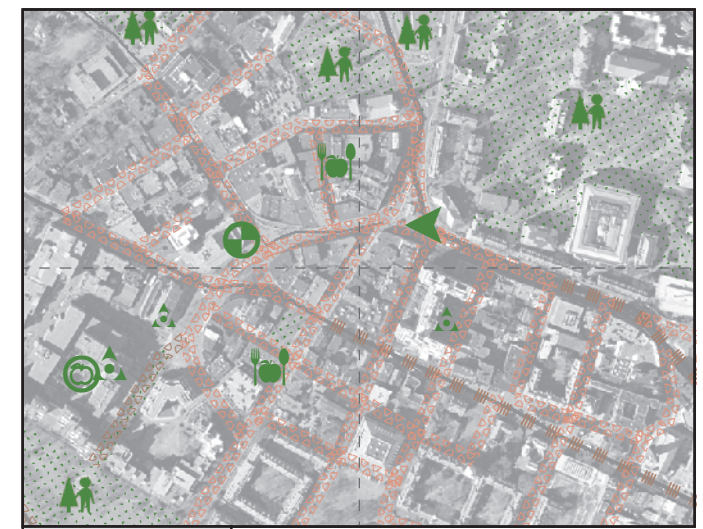
Harvard Square 3x Central Square

For more information about car sharing visit Zipcar.com Learn about creating Backyard Habitats at NWF.org