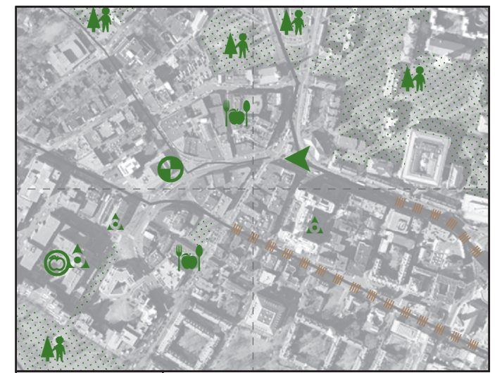
Harvard Square 3x Central Square