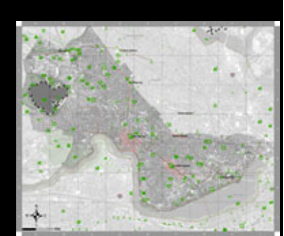
GreenMap MIT: mapping environmental resources around MIT and Cambridge