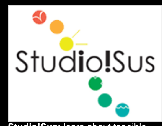
Studio!Sus: learn about tangible ways to live sustainably